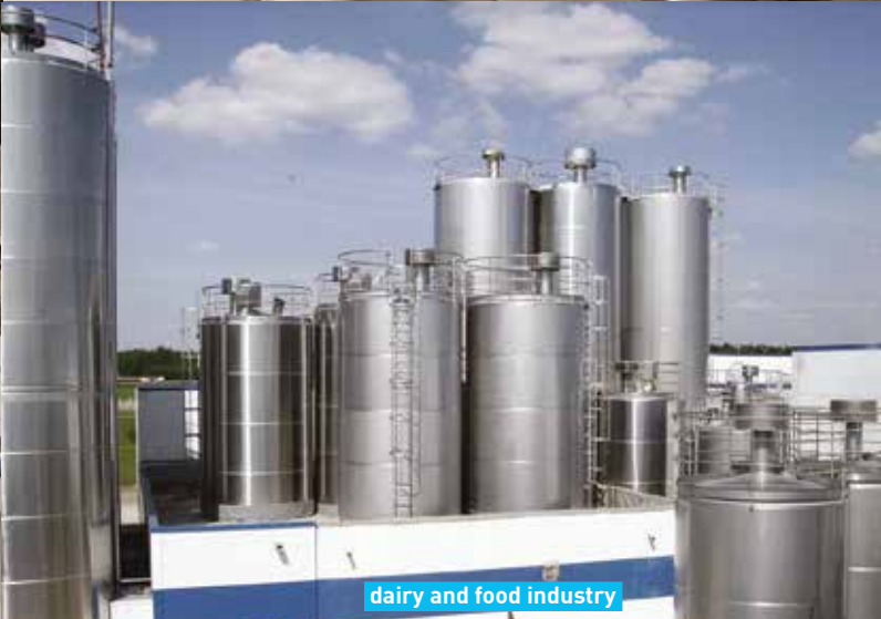
dairy and food industry